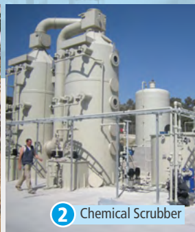
2 Chemical Scrubber