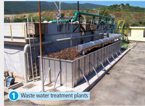
1 Wastewater treatment plants