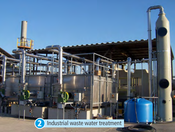
2 Industrial waste water treatment