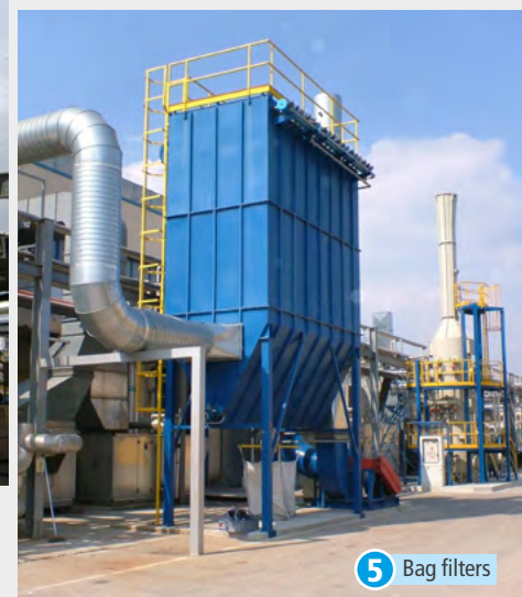
5 Bag filters