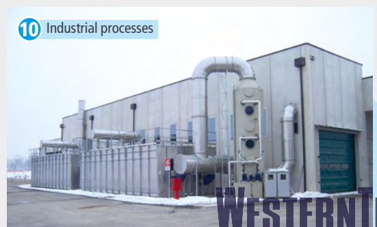
10 Industrial processes