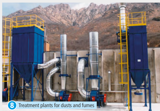
8 Treatment plants for dusts and fumes