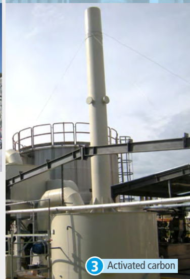
3 Activated carbon