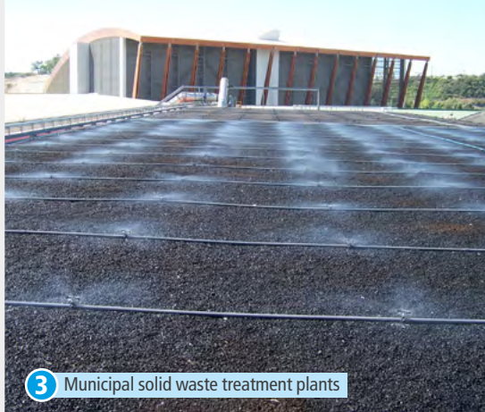
3 Municipal solid waste treatment plants